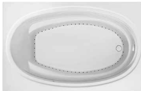
Symphony 4 with air shown