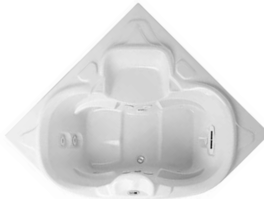
*Available without fast-fill waterfall spout.